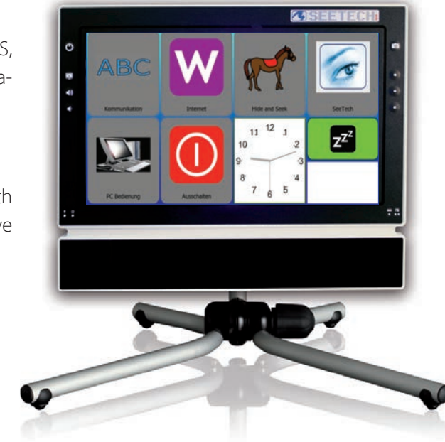
SeeTech® ONLY Module